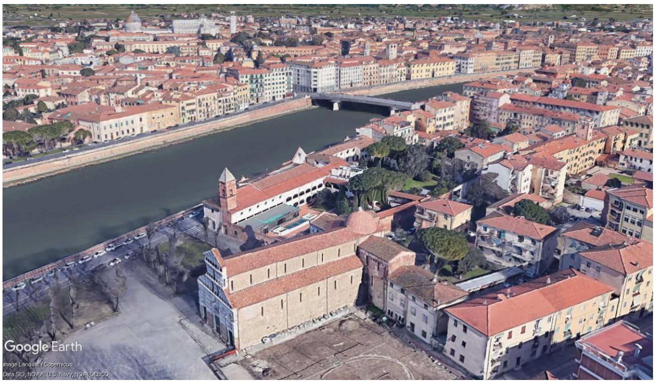
<The role of interactive teaching/learning approaches in the development of soft skills for Civil Engineering Education>

PISA – Le Benedettine – University of Pisa Congress Centre