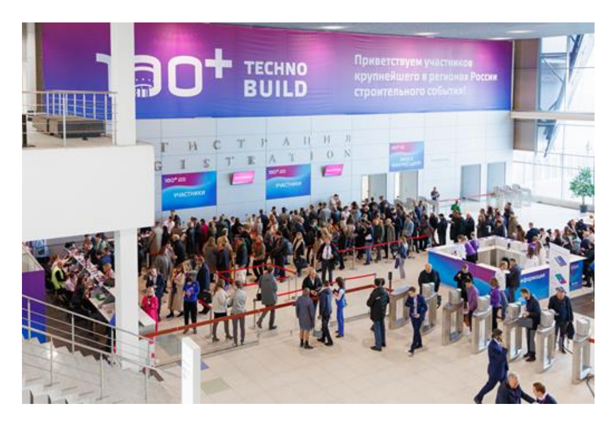
Photos from IX International Forum 100+ TechnoBuild (October 18-21 at IEC Ekaterinburg-EXPO) (https://forum-100.ru/novosti/fotootchet-100-technobuild-2022/)