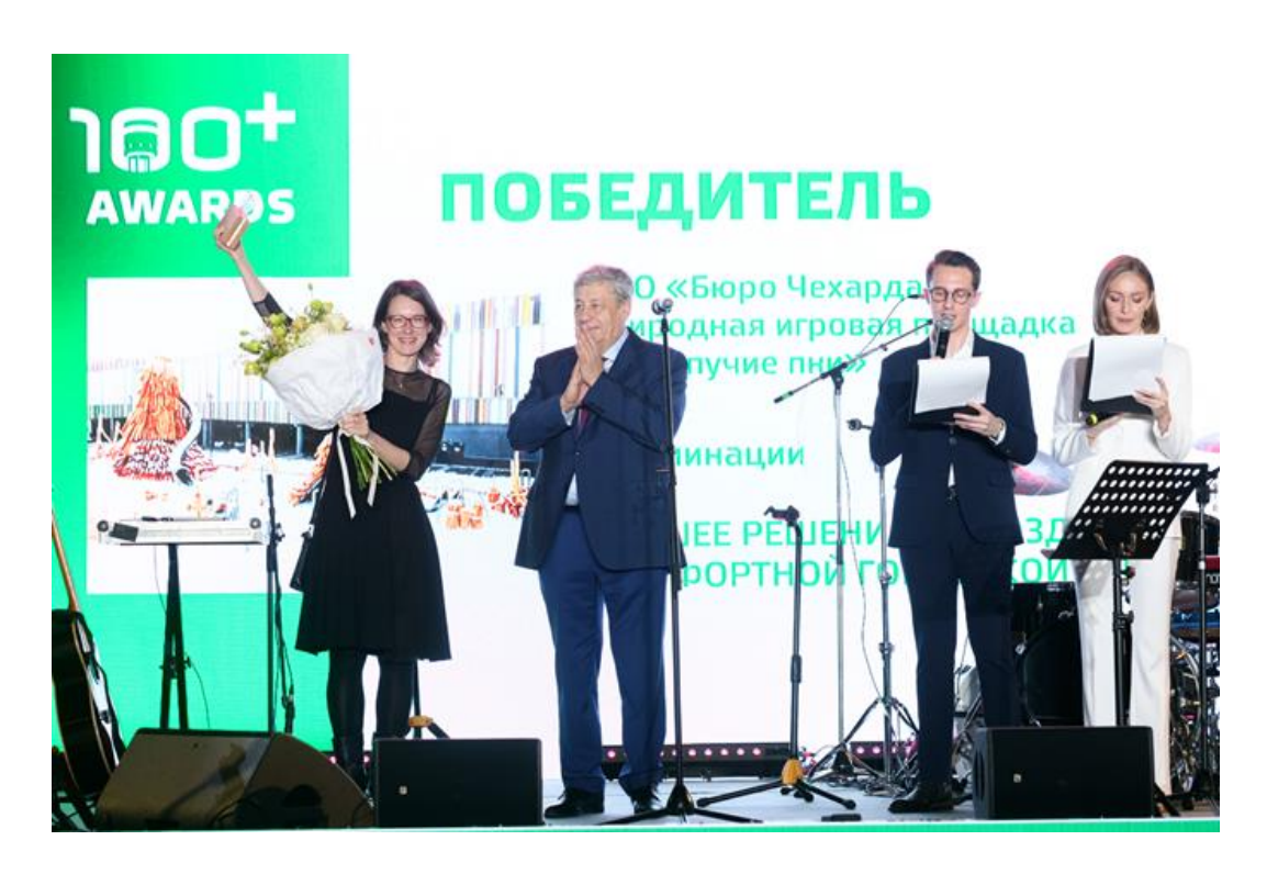
Photos from 100+ AWARDS 2022 (https://forum-100.ru/novosti/fotootchet-100-technobuild-2022/)