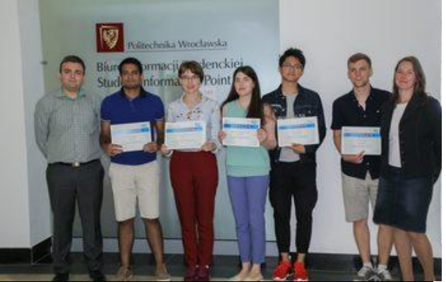
Participants at the summer schools