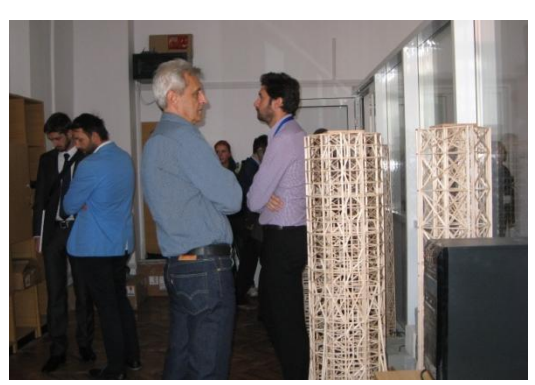
Some photos taken at the Laboratory of Seismic Engineering and Dynamics